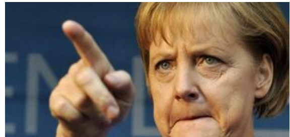
Angela Merkel as German Chancellor stated that "the pandemic is not over until all people in the world have been vaccinated"