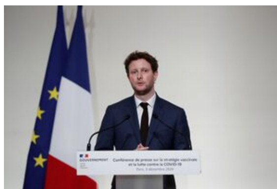
Clément Beaune announcing the vaccine strategy

Jens Spahn was made German Health minister after attending the 2017 Bilderberg, rejected a donation of hydroxychloroquine in 2020 [90] and stated that "vaccines are the way out of this pandemic"