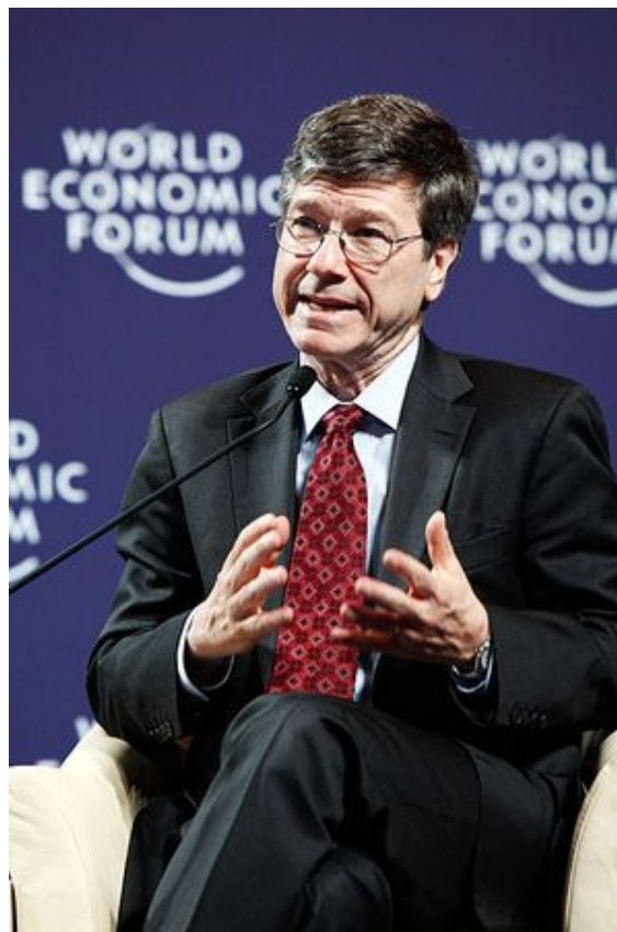
Jeffrey Sachs, who was made chair of the Lancet Commission on COVID-19 after Peter Daszak recused himself