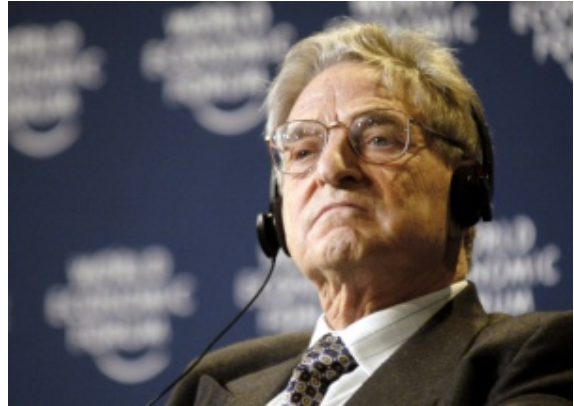
George Soros, of The Good Club, is suspected to have been controlling the narrative through groups such as BLM