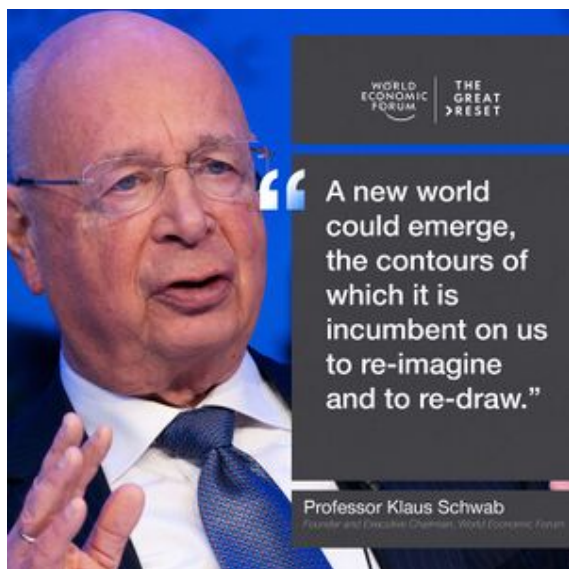
Klaus Schwab, ex-Bilderberg Steering Committee

The Great Reset is an SDS attempt to reframe of economic inequality in a positive light: "You'll own nothing, and you'll be happy". COVID-19 has greatly increased economic inequality as small and medium enterprise have been forced under while unprecedented peacetime increases in the money supply and corporate welfare have been doled out to a few large organisations.