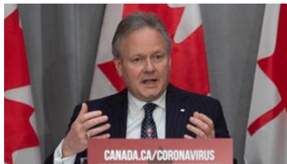
Stephen Poloz speaking in March 2020. [199]