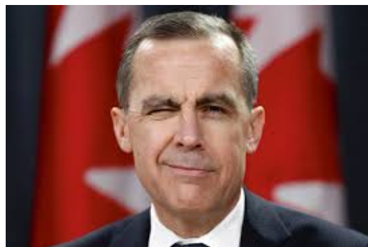
Mark Carney, Tri-national, quad-Bilderberger, Governor of the Bank of England until March 2020, when he became an "informal adviser" to Prime Minister Justin Trudeau