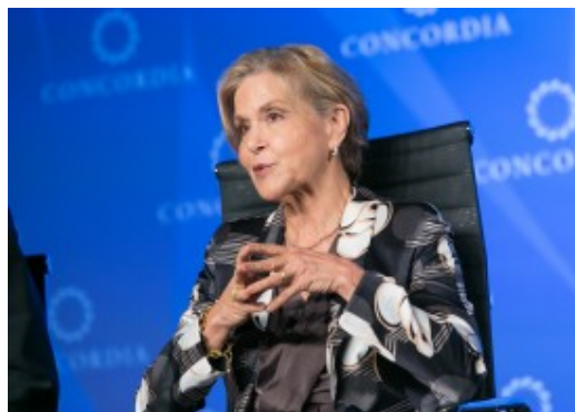
Judith Rodin took part in the 2010 Lock Step exercise about using a pandemic to usher in high tech totalitarianism

In Spring 2020, many nation states formed COVID-19 Task Forces , many of which had, or acted as if they had, " state of emergency " powers to override standard operating procedure .