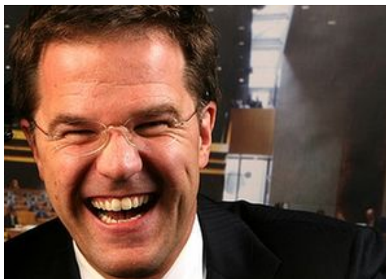
Mark Rutte, six time Bilderberg visitor, as Dutch PM fired his Economic Affairs Minister, Mona Keijzer, shortly after she publicly criticised the Dutch Vaccine passport. [152]