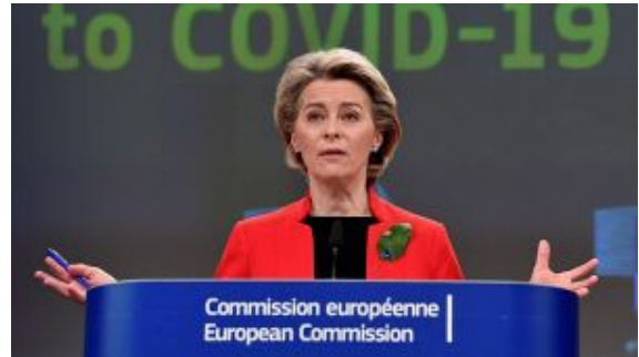
Ursula von der Leyen, a figure of great importance in COVID-19 event